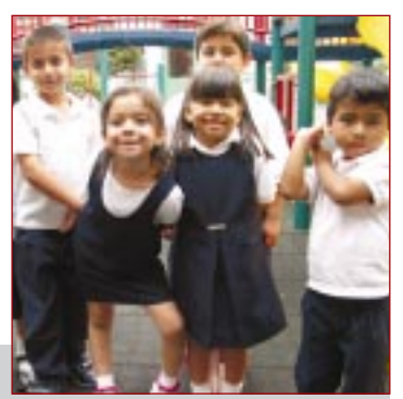
Parents and students, teachers and administrators all have a role to play in designing Oakland's new small schools.

and teachers moved from one available classroom to the next. Teachers were frustrated, parents were angry, and too many students — including Paulino's son, MacEdward, were falling through the cracks.