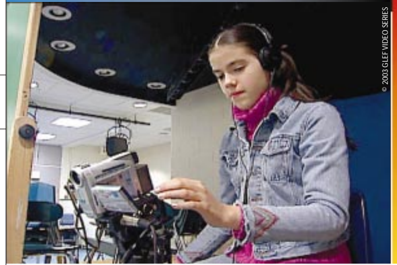
HANDS-ON LEARNING: A STUDENT DIRECTS HER CLASSMATE IN A MULTIMEDIA PROJECT ON CAREER PLANNING.