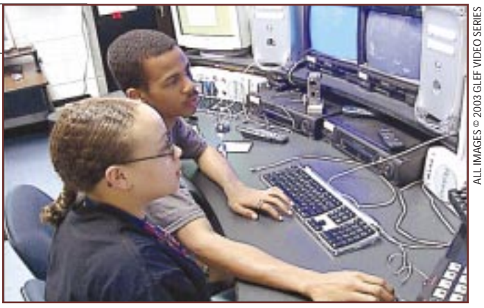
Students at an editing station match music to images in a tribute to the firemen of 9/11.

To support the vision that emerged — one that put literacy first and embraced rigor-